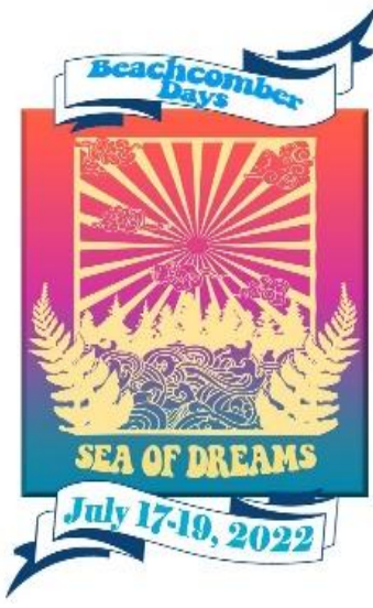
Book Give-Away at Beachcomber Days June 18, 2022

The Friends of the Waldport Public Library helps support the Lincoln County Reads program with other county libraries and the Lincoln County Library District. The Lincoln County Reads program brings authors and community readers together through moderated author presentations and Q & As.